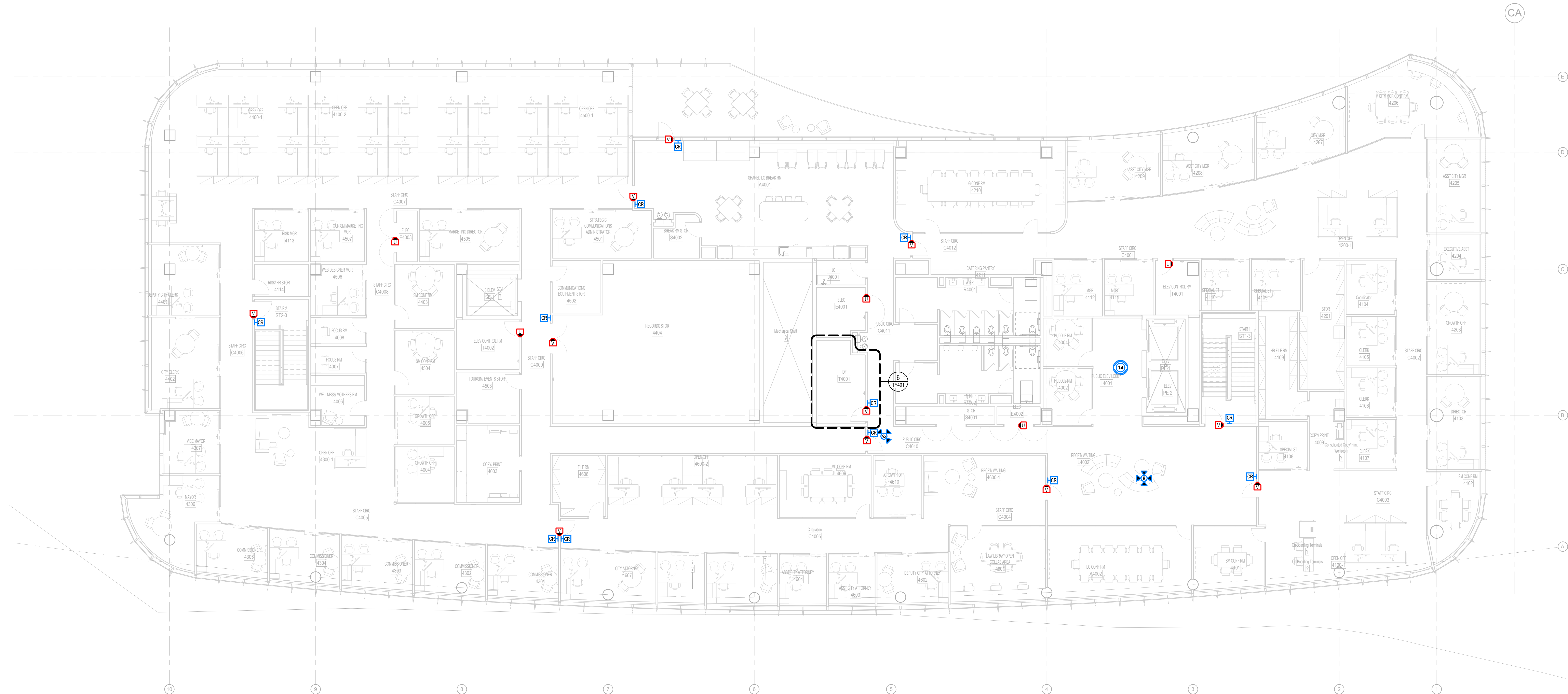
1 SECURITY FLOOR PLAN - LEVEL 4 - CITY HALL 1/8" = 1'-0"